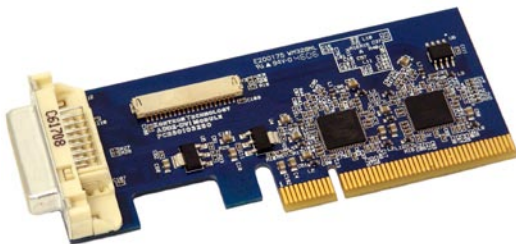
ADD2-DVI-Dual Part # 820952