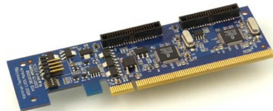
ADD2-LVDS-Dual Part # 820950